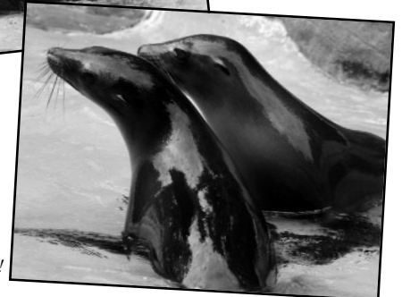
Summer and Calli's press photo!